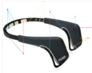
(E) The MUSE EEG headset which can be used to read brainwaves